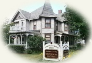
John Smart House

206 N. Elmwood Medina Ohio 44256 www.medinacountyhistoricalsociety.com mchs@zoominternet.net Established 1922