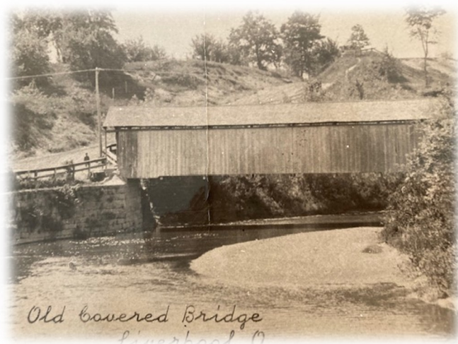
Old Covered Bridge, Liverpool, Ohio