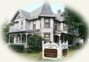
John Smart House

206 N. Elmwood Medina Ohio 44256 www.medinacountyhistoricalsociety.com mchs@zoominternet.net Established 1922