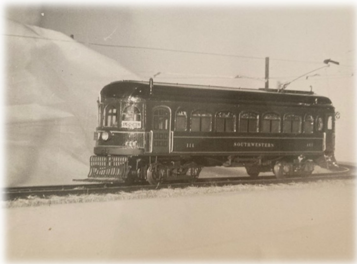
Cleveland Southwestern car made by Erwin Schmidt